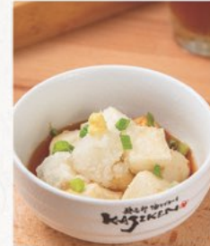
AGE TOFU Deep-fried Tofu w. Grated Radish 6.50