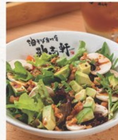
SALAD Spring Mix w. Avocado, Mushroom Tomato, Fried Onion 7.00