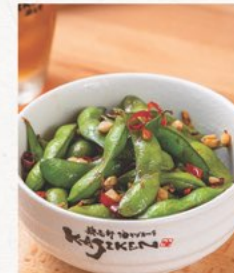
EDAMAME Choose Spicy Chili or Wasabi Garlic 6.50