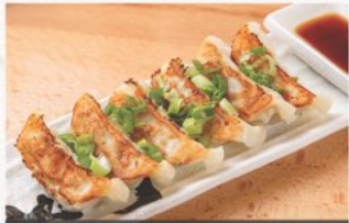
GYOZA 7.00 Pan-fried Pork Dumplings, topped with Scallion