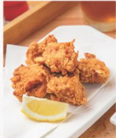
KARAAGE Deep-fried Marinated Chicken 7.00