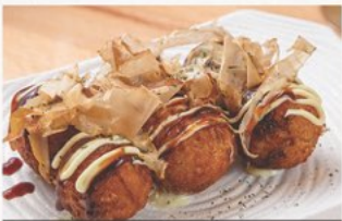
TAKOYAKI 9.00 Deep-fried Octopus Balls, topped with Bonito Flakes