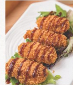
KAKI FRY Deep-fried Oysters w. Egg Tartar 8.00