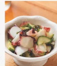
SUNOMONO Cucumber Salad w. Octopus and Seaweed 7.00