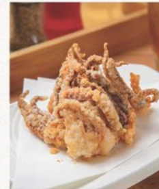
GESOKARA Deep-fried Squid Tentacles 10.00