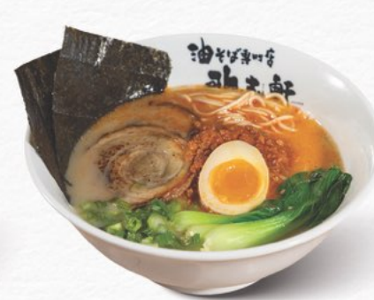
ピリ辛とんこつラーメン *SPICY TONKOTSU Thin Noodles in Pork Broth, topped with Soft Boiled Egg, Bok Choy, Spicy Minced Pork, Pork Belly Chashu, Nori, Onion and Scallion Add Black Garlic Oil +$1.00 19.25