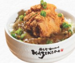
唐揚げカレー丼 KARAAGE CURRY DON 10.50 Fried Chicken with Curry and Scallion 10.50