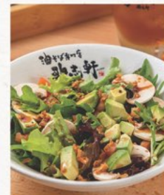
SALAD Spring Mix w. Avocado, Mushroom, Tomato, Fried Onion 9.50