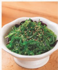
WAKAME Seaweed Salad (Hiyashi Wakame) 7.00