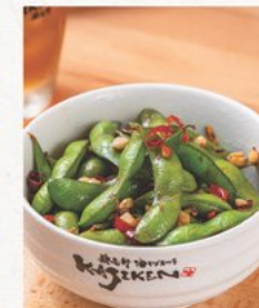
EDAMAME Choose Spicy Chili or Wasabi Garlic 7.00