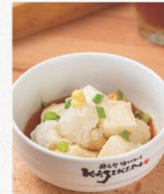
AGE TOFU Deep-fried Tofu w. Grated Radish 8.00