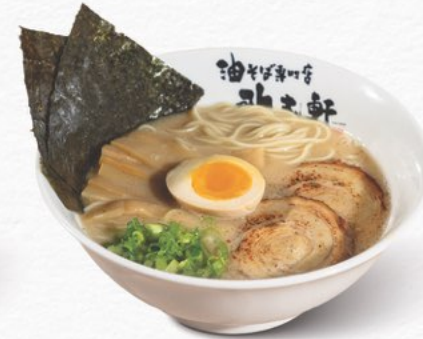
とんこつ醤油ラーメン *TONKOTSU SHOYU Thin Noodles in Soy Sauce Pork Broth, topped with Pork Belly Chashu, Soft Boiled Egg, Menma, Nori and Scallion Add Black Garlic Oil +$1.00 18.00