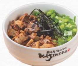
チャーシュー丼 CHASHU DON 8.50 Marinated Diced Chashu, Scallion and Nori 10.00