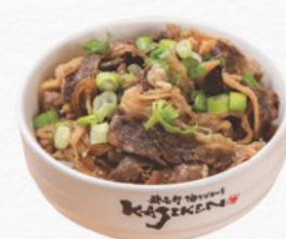
すき焼き丼 SUKIYAKI DON 10.50 Marinated Sliced Beef, Onion and Scallion 10.50

*Some of our food contains undercooked egg. If you have any food allergy, please inform our staffs before ordering. ***20% gratuity will be added to the parties of six or more.