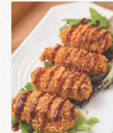
KAKI FRY Deep-fried Oysters w. Egg Tartar 10.00