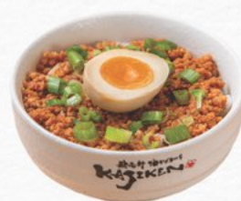
ピリ辛丼 *HOMURA DON 10.00 Spicy Minced Pork, Soft Boiled Egg and Scallion 10.00