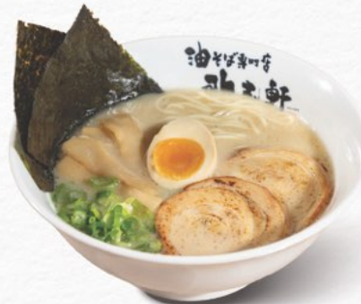
とんこつラーメン *TONKOTSU Thin Noodles in Pork Broth, topped with Pork Belly Chashu, Soft Boiled Egg, Menma, Nori and Scallion Add Black Garlic Oil +$1.00 18.00