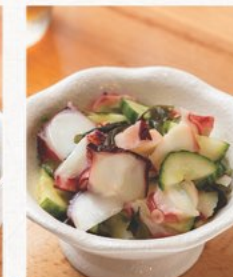
SUNOMONO Cucumber Salad w. Octopus and Seaweed 9.00