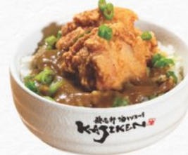
唐揚げカレー丼 KARAAGE CURRY DON 8.50 Fried Chicken with Curry and Scallion 8.50