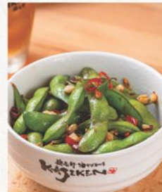
EDAMAME Choose Spicy Chili or Wasabi Garlic 6.50