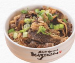
すき焼き丼 SUKIYAKI DON 9.00 Marinated Sliced Beef, Onion and Scallion 9.00

*Some of our food contains undercooked egg. If you have any food allergy, please inform our staffs before ordering. ***20% gratuity will be added to the parties of six or more.