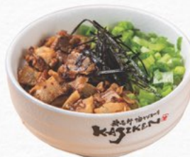
チャーシュー丼 CHASHU DON 8.50 Marinated Diced Chashu, Scallion and Nori 8.50