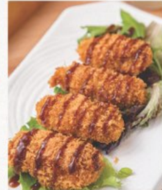
KAKI FRY Deep-fried Oysters w. Egg Tartar 9.00