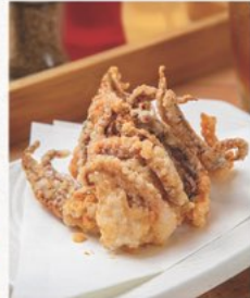
GESOKARA Deep-fried Squid Tentacles 9.00