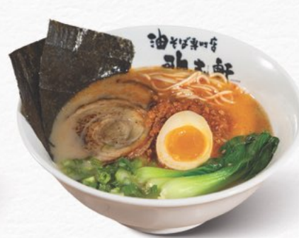
ピリ辛とんこつラーメン *SPICY TONKOTSU Thin Noodles in Pork Broth, topped with Soft Boiled Egg, Bok Choy, Spicy Minced Pork, Pork Belly Chashu, Nori, Onion and Scallion Add Black Garlic Oil +$1.00 18.50