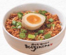
ピリ辛丼 *HOMURA DON 8.50 Spicy Minced Pork, Soft Boiled Egg and Scallion 8.50