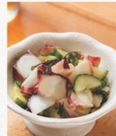
SUNOMONO Cucumber Salad w. Octopus and Seaweed 7.50