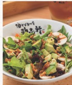
SALAD Spring Mix w. Avocado, Mushroom, Tomato, Fried Onion 7.50