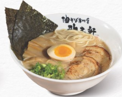
とんこつ醤油ラーメン *TONKOTSU SHOYU Thin Noodles in Soy Sauce Pork Broth, topped with Pork Belly Chashu, Soft Boiled Egg, Menma, Nori and Scallion Add Black Garlic Oil +$1.00 17.00