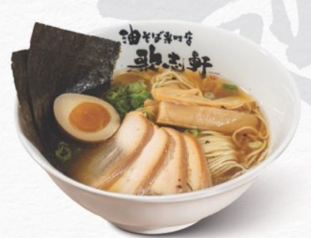
鶏醤油ラーメン *TORI SHOYU Thin Noodles in Soy Sauce Chicken Broth, topped with Chicken Chashu, Soft Boiled Egg, Menma, Nori and Scallion 17.00