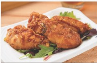
TEBASAKI 8.00 Nagoya Style Fried Chicken Wings