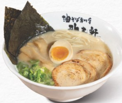
とんこつラーメン *TONKOTSU Thin Noodles in Pork Broth, topped with Pork Belly Chashu, Soft Boiled Egg, Menma, Nori and Scallion Add Black Garlic Oil +$1.00 17.00