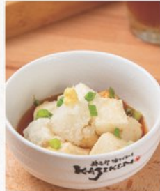
AGE TOFU Deep-fried Tofu w. Grated Radish 6.50